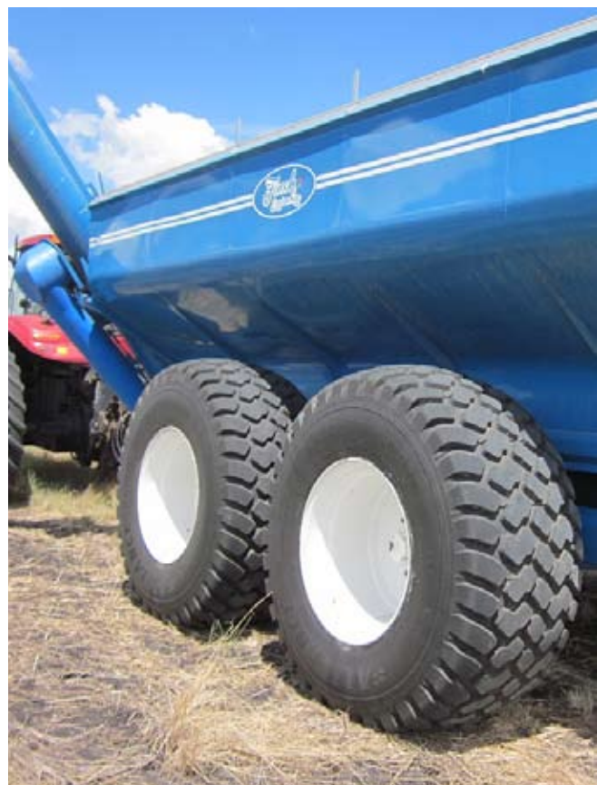
Alliance A-390 Flotation Radial tires mounted on Mr. McLaren's Finch Engineering wheat chaser bin. The same heavy loads with much lower inflation pressure.

satisfied. He now enjoys the A-390 characteristics that guarantee high flotation, low soil compaction and great comfortability.