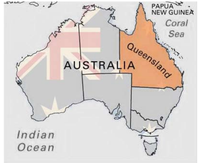
Queensland is the second largest state, by area, in Australia, located in the north-east of the country.

The results amazed Brett. The fact that he can now use his Finch Engineering wheat chaser bin with much lower inflation pressure for the same load made him extremely