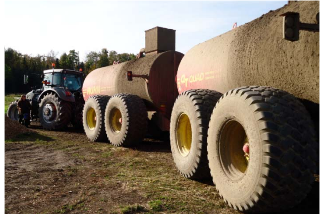
A heavy duty Nuhn liquid manure spreader with Alliance 390 Flotation Radial tires on. "it is a lot easier to pull, there is more surface area on the ground"

The Alliance 390 Agri-Transport Flotation Radial series combines the best characteristics of flotation tires with the best characteristics of radial construction in order to have superior performances on the road and in the field application. Those characteristics guarantee high flotation, low soil compaction and great comfortability .