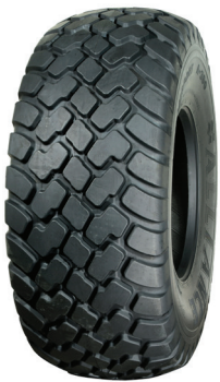
A390 Flotation Radial

He has also been using the Alliance FarmPRO radial in his towed sprayer to good effect.