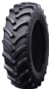
FarmPRO 85 Radial