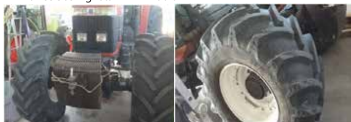
600/65 R 28 . 147 D 365 Agristar mounted on the front axle