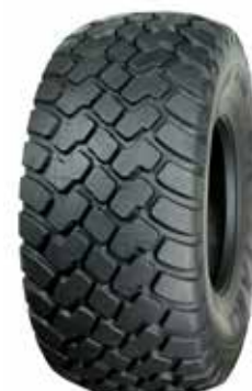
Veenhuis 3-axle slurry tankers equipped with 800/60R32 Alliance 390