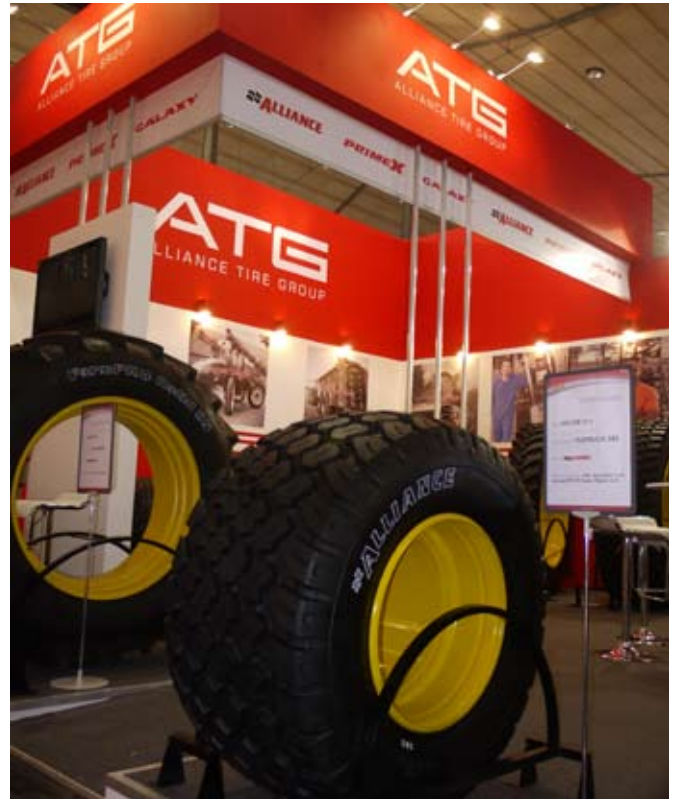
The new Alliance 382 High-Speed radial flotation tire. Enables drive of up to 100KM/H !

An impressive number of leading OEs chose ATG's products for their equipment. An outstanding record number of over 400 ATG tires were mounted on different machines in various OEs' stands throughout the Agri Technica show. ATG tires were shown on tractors, trailers, agricultural trucks, combines, spreaders, sprayers, and many other kinds of machines. In today's competitive tire market, this high number is an evidence of a solid recognition in ATG tires' superior quality, performance, and benefits.