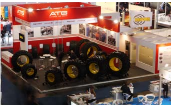
ATG's stand at Agri Technica 2011

The high interest in ATG's new innovative tires unveiled in this show is significantly contributing to fortify our reputation as a leading tire group."