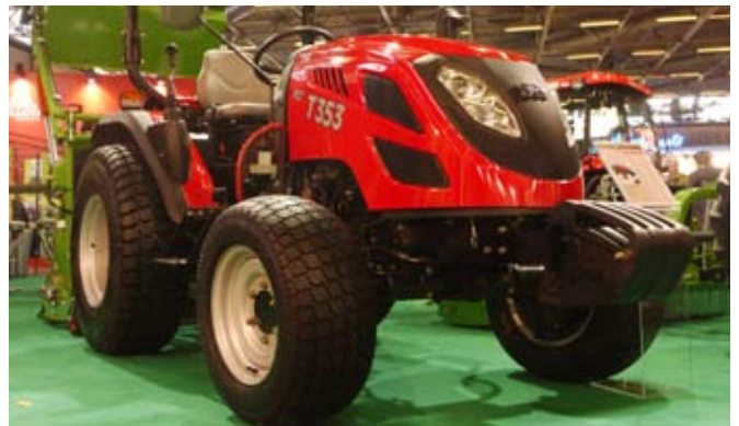
More of ATG tires mounted on machines throughout the show.