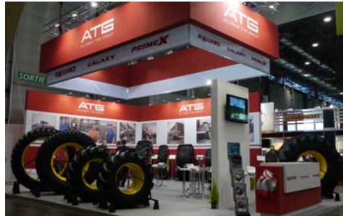
ATG's 150m 2 booth at the SIMA 2011 show. 16 tires represented the group's cutting edge tire technology and advanced products for agriculture, forestry and industrial uses.

In addition to the tires in the ATG booth, a record number of over 300 of ATG tires were mounted on different machines on display at various OEs' stands throughout the fairgrounds. Dozens of flotation radial tires were shown on wagons, trailers, and spreaders, as well as many A-350 Row Crop tires on sprayers. A high number of radial tractor tires were mounted on different agriculture vehicles. This outstanding number of machinery shod with ATG tires establishes the Group's credibility in today's competitive tire market. It is also reflects a trend of leading OEs who recognized the benefits of ATG tires' superior quality and chose ATG's products for their equipment.