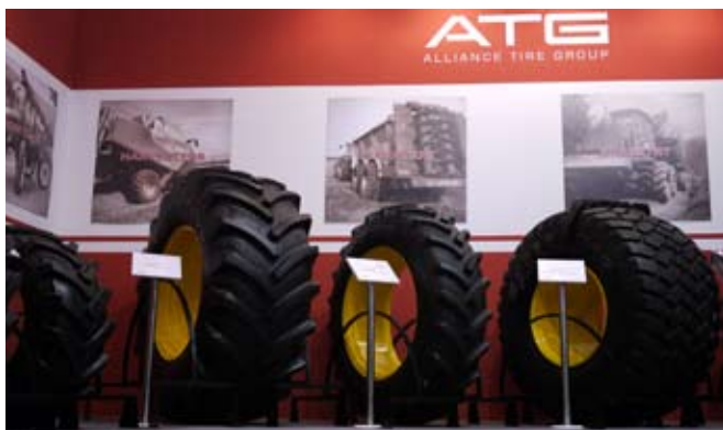
The new FarmPRO 842 (in the middle) was presented at the SIMA show for the first time. It was one of 16 ATG tire at the Group's stand at the exhibition.

During the show ATG showcased, for the first time, its newly developed FarmPRO 842 radial tractor drive tire series. This new series is being manufactured at the new ATG plant in India. Among the other tires presented by ATG at the show were the Alliance A-350 Row Crop, the Alliance 550 MULTIUSE, Alliance F-344 Forestar flotation, A-375 Radial tire for Combine, and A-390 HD, for heavy duty uses. ATG also exhibited the Galaxy Beefy Baby, Hulk, and Giraffe XLW tires.