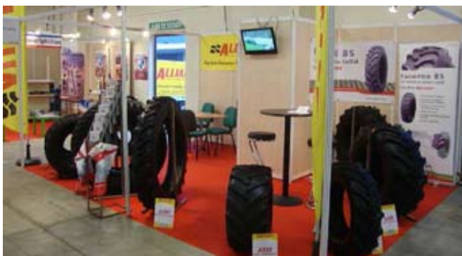
ATG's stand at SITEVI 2011

THE event offers an exhaustive range of products and services to meet a complete range of needs. This year, the emphasis was placed on developing the range of fruit and vegetable products and services on show, along with olive-growing, irrigation, renewable energies, and lastly packaging, packing and handling. SITEVI is also the leading event for the wine-growing industry as a whole (environmentally-friendly and organic wine-growing, biodynamic agriculture, bulk packing, bottling, export, and more).