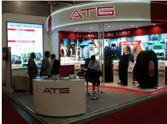
ATG's stand at Tyrexpo Asia 2013

March 31, 2013 - Tyrexpo Asia 2013 exhibition in Singapore set new standards for the region's leading independent tire and equipment event. With a high number of exhibitors and thousands of visitors, the exhibition was an optimal showcase platform for the tire industry